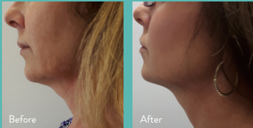
Secret Faces Clinic